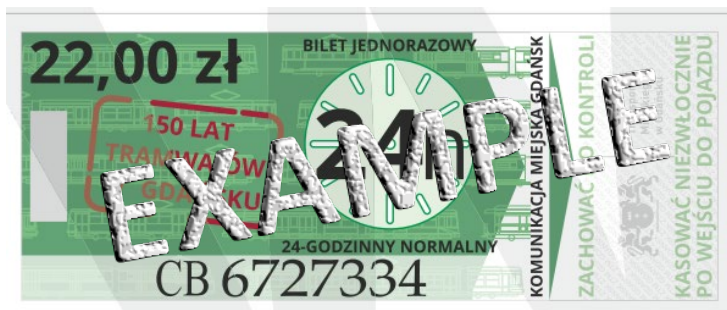
A normal 24-hour bus / tram ticket (travelling for 24 hours, no line limitations)