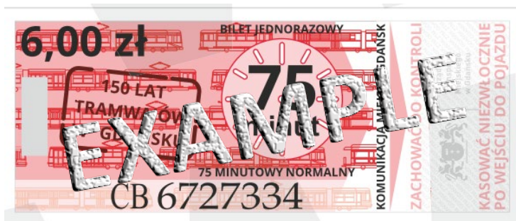
A normal 75-minute bus / tram ticket (travelling for 75 minute and no line limitations)