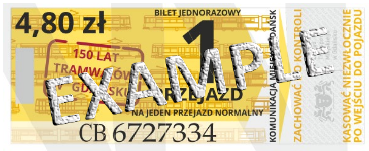
A normal 1-ride bus / tram ticket (travelling with no time limitations, but using only one line)